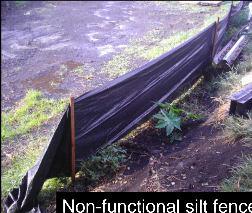
Non-functional silt fence